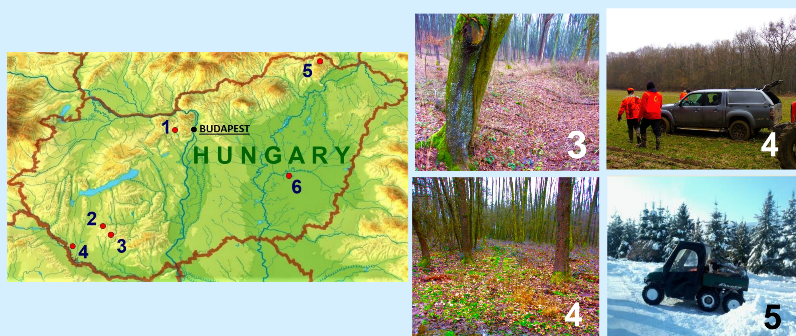
Figure 1. Geographical locations of the sampling sites within Hungary. (1) Herceghalom, Pest County (domestic pig, broiler chicken) (2) Kaposvár, Somogy County (domestic pig) (3) Vörösalma, Zselic Hills (red deer) (4) Zsitifapuszta, Dráva Valley (red deer and fallow deer) (5) Füzérkömlös, Zemplén Mountains (wild boar) (6) Szarvas, Békés County (common carp).

Altogether 26 domestic pig and wild boar ( Sus scrofa ), common carp ( Cyprinus carpio ) and broiler chicken ( Gallus gallus domesticus ) intestinal content samples collected in Hungary between 2016 and 2021 were examined. In addition, intestinal content sampling was performed by use of sterile swabs from the colon or caecum content of red deer ( Cervus elaphus ) and fallow deer ( Dama dama ) at regular hunts in January 2023 at Vörösalma and Zsitifapuszta, in Somogy County (Figure 1).